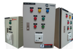
AHU Starter Panel (Option)