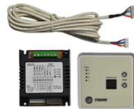
1, 2, 4 Stage Thermostat - Digital Display (Option)